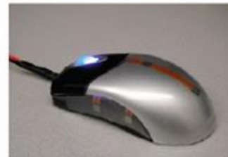
Wireless Skin Conductance Sensor